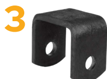
FH60N Front Hanger Suit 60mm Spring