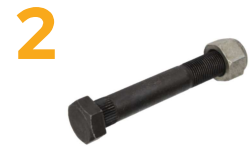
SB16100 Shackle Bolt Solid with Nyloc Nut Suit 60mm Spring