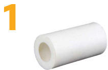
NB122245 Nylon Bush Suit 45mm Spring