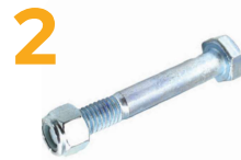
B31/2Z 1/2" x 3.5" Mild Steel Bolt Suit 45mm Spring