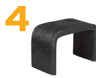
RH45N Rear Hanger Suit 45mm Spring