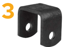
FH45N Front Hanger Suit 45mm Spring