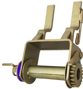
* Clip on Winch with and without strap